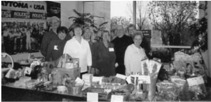
BMW Day... FOCAS is grateful for corporate support for community education on animal welfare.