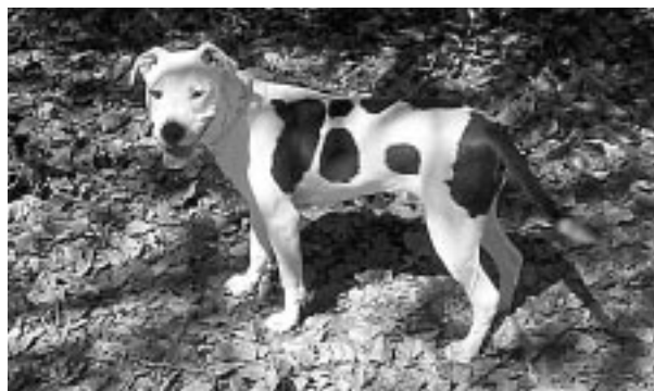
Scooter Treated for a broken leg.