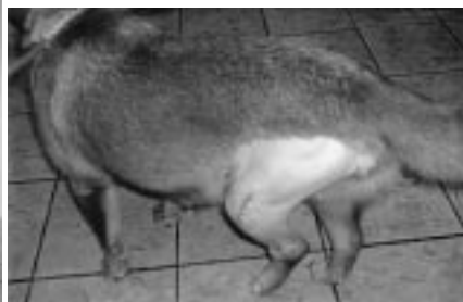
Kitten – five month old female surgery for severely fractured leg.