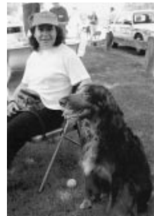
Kris and Digby, adopted from the Bergen County Animal Shelter, spreading the good word in New Milford... save a life, adopt from a shelter.

Programs – See a descriptive list of FOCAS programs on page 3 of this issue of The Scoop and at our website www.focasnews.org .