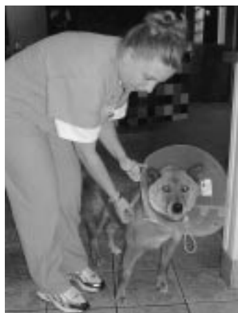
Ginger Surgery for severe leg fracture