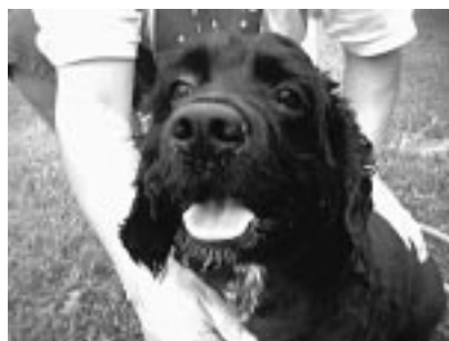
Rocky Treated for vision problems, kennel cough