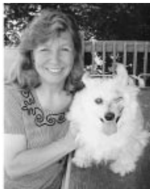
Blinky Surgery for eye; treated for respiratory problems

They come in all sizes and ages. Their need is immediate. Thanks to you, our faithful contributors, FOCAS's Angel Fund continues to provide extraordinary medical care to shelter animals that would otherwise face permanent disability or euthanasia.